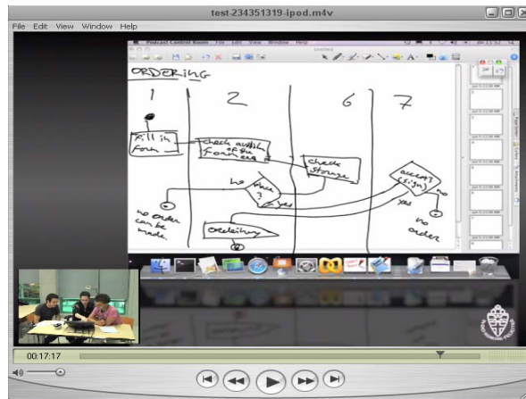
Fig. 2. Snap-shot of the recording